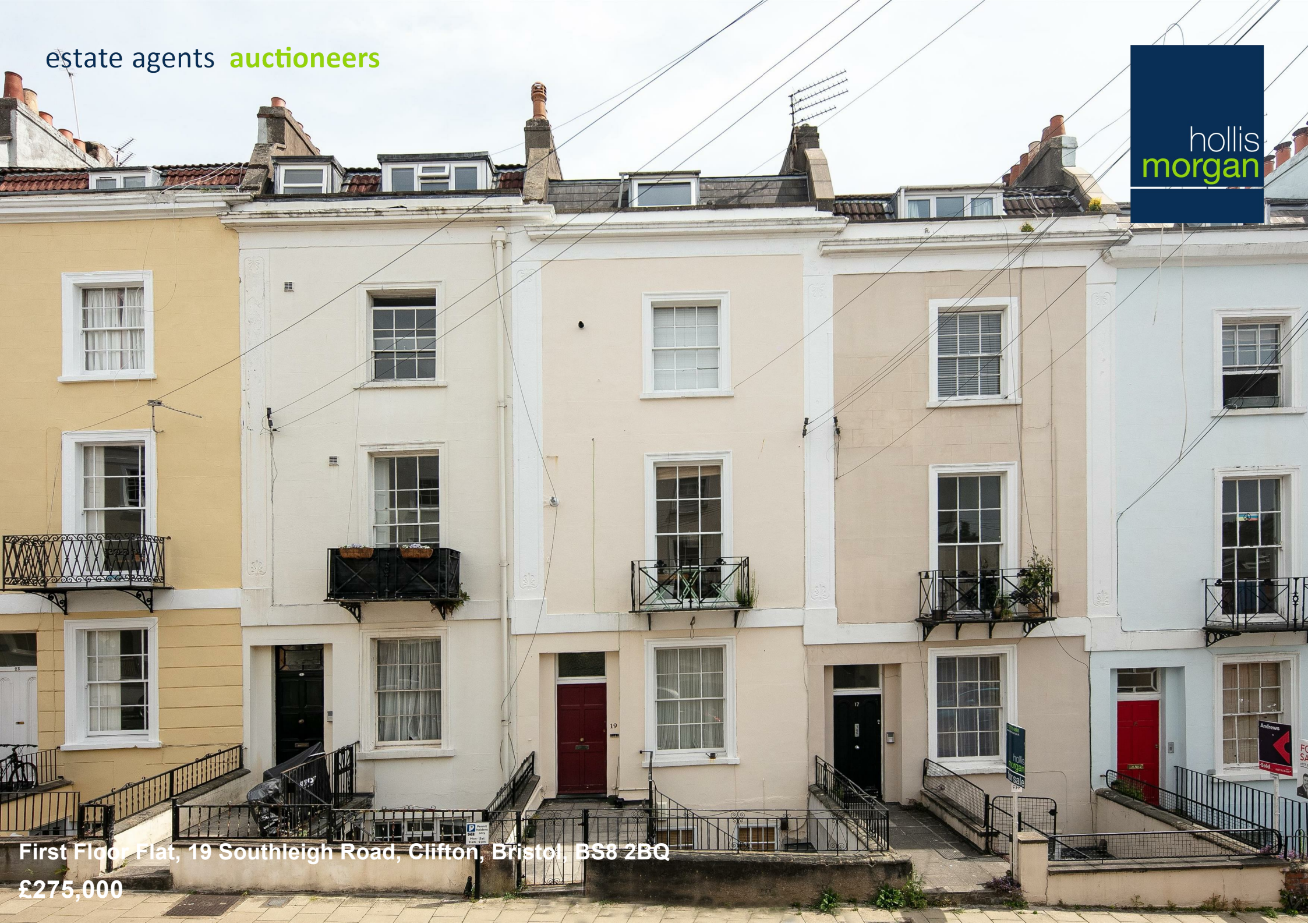
First Floor Flat, 19 Southleigh Road, Clifton, Bristol, BS8 2BQ